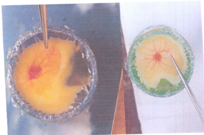
Plate 1: Control, Echis ocellatus venom (4.2 µg/ml) without extract. Forceps point to the spot of haemorrhagic lesions.